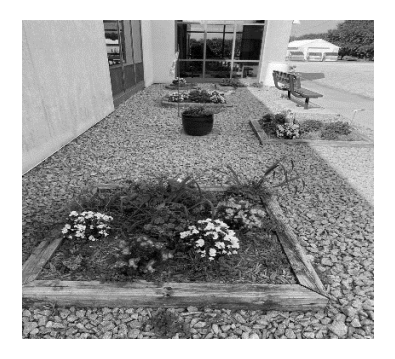
One of the Fairy Tale Gardens which are planted by students each year

Over $1,000,000 given to Mt. Olive Schools from donors through our alumni, individuals, business donations, memorials, and special grants.